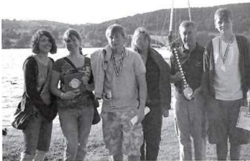
Prize-haul from the Miracle Ullswater Nationals