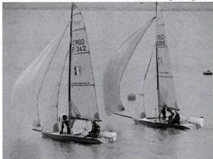
The two boats featured in these articles, seen in much lighter winds during the Warm-up Series

On Monday the start wasn't until the afternoon because the 49ers were finishing off their racing, so we set up the boats and put the sails up and went on the water, there was hardly any wind when we started off to the race area an hour and a half before the race was scheduled, but luckily as we made our way out to the race course the wind started building and was a good breeze when it was finally time for us to start racing. The signal went up for the 5 minutes, all of the crews on the 49 boats set their watches for the count down, it was tense, looking for the right position on the line and where the line bias was, it was a tantalising 5 minutes. 5, 4, 3, 2, 1 GO I said, and then a hooter went off we all looked around and saw the general recall flag! And again this happened but this time the a black flag was put up, we were all going to be careful this time, after this the first race half of the fleet were black flagged and were given BFD, we managed to get a 12 th , wow we thought, we can do it! So for the next two races after this the fleet were more cautious about being blacked flagged, but not as cautious as they could have been and again a few people were black flagged and we managed to get a 21 st , we were doing well, so the next race came and